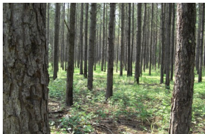
Growing tomorrow's forests today

McShan Lumber Company, Inc. appreciates your help in improving the professionalism of the forestry community and the practice of sustainable forestry. If you have any questions about our SFI Program, please feel free to contact us.