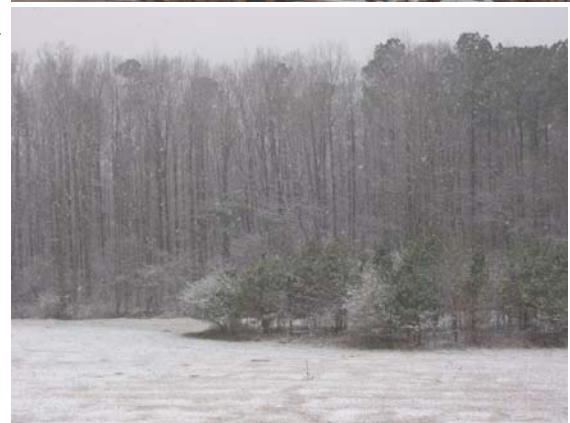
Conditions here on Friday, February 12, 2010